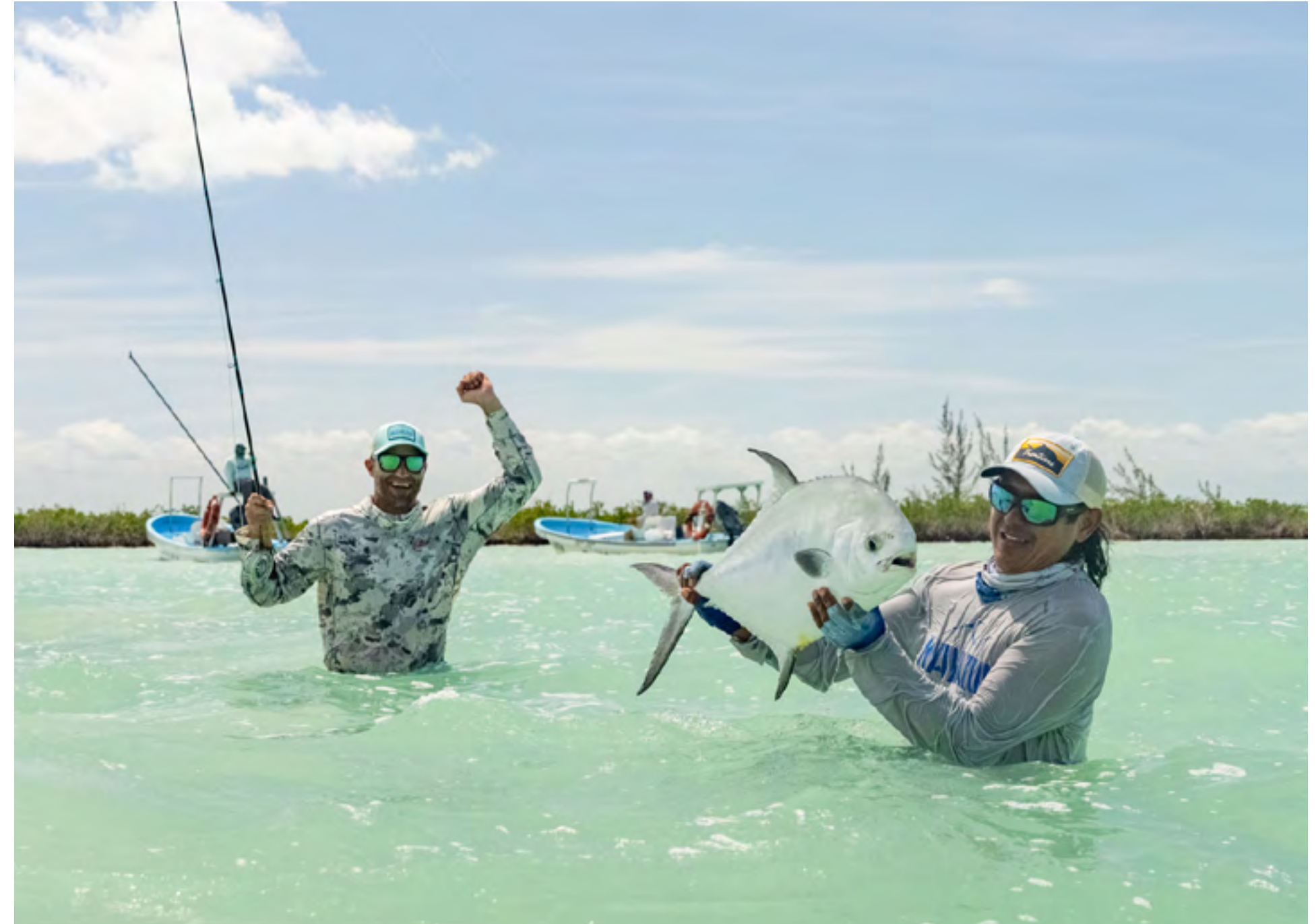
A big permit in hand-the final product of dreams,planning, work, luck, and clean living!