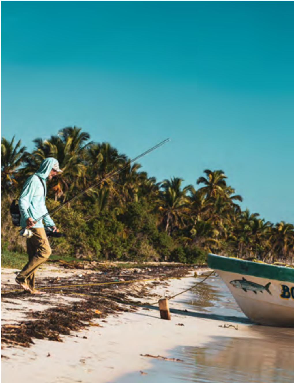
Comfortable pangas-Permit landing craft- are beached right near the lodge. No bumpy roads. No wasted time trailering.