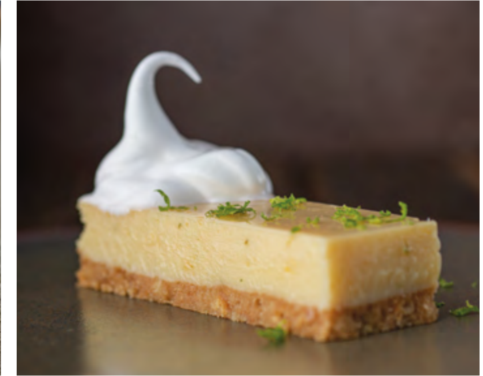
Key Lime Pie